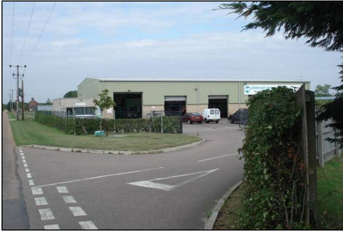
(iv) View of Stubbins Marketing Ltd from the west to east section of Oaktree Road