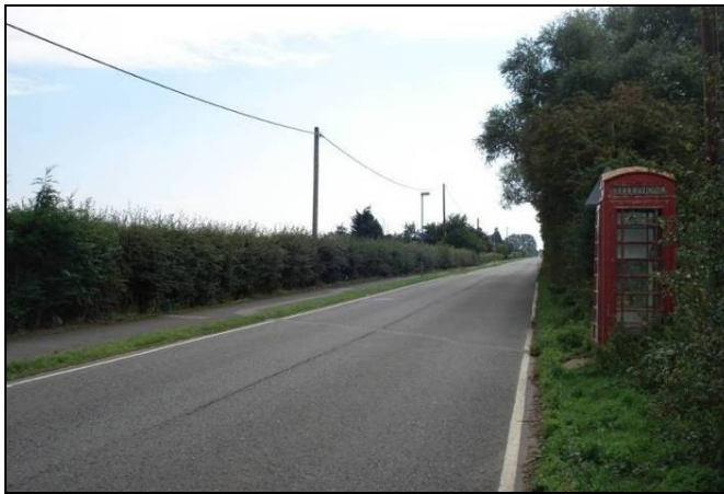
Figure c: Views of Mill Road, looking south-west towards the A14