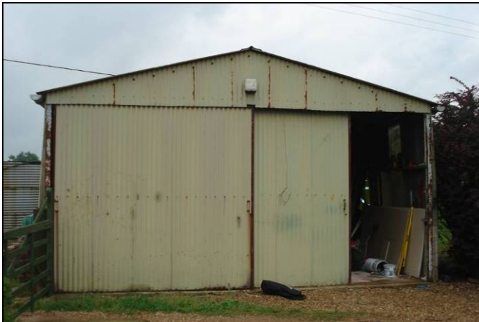
Figure m: An agricultural building