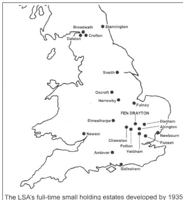
Figure a: The LSA estates in 1935