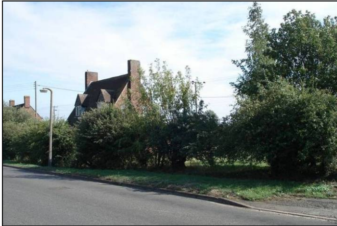
Figure i: A 'chalet' style dwelling