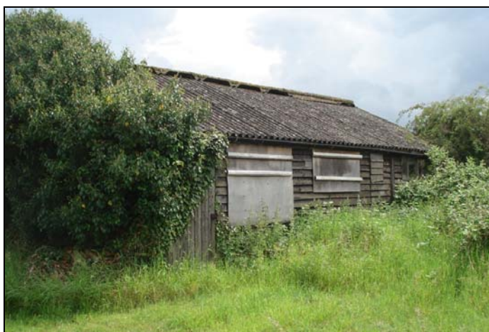
Figure j: A piggery