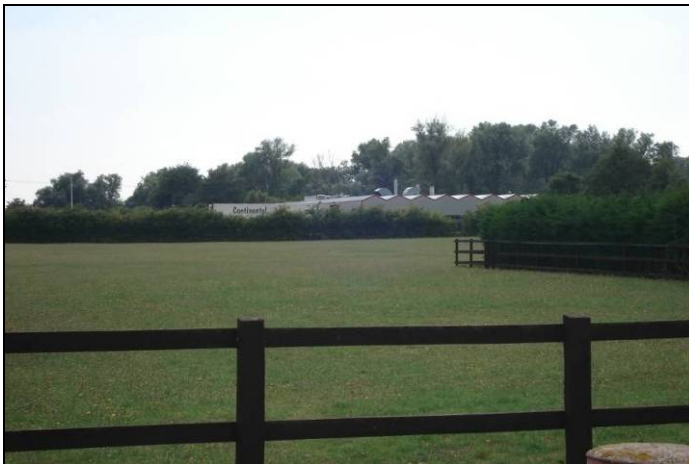
(v) View of Stubbins Marketing Ltd from its entrance on Oaktree Road