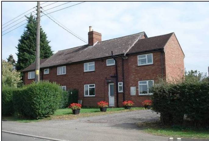
Figure h: A pair of extended semi-detached dwellings